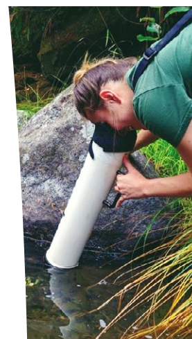
Coastal Wetlands Monitoring

Develop a technical design or implementation plan for restoration, including consideration for compliance with the National Historic Preservation Act.