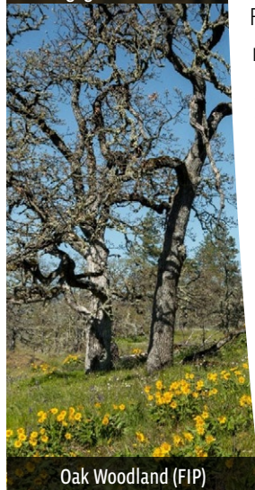
Oak Woodland (FIP)

Landscape-scale restoration investments that address board-identified priorities. Successful FIPs achieve clear and measurable ecological outcomes; use integrated, results-oriented approaches and are implemented by a high-performing partnership. Funds partnerships with up to $12 million over 6 years.