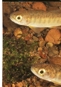
Coho Habitat Restoration